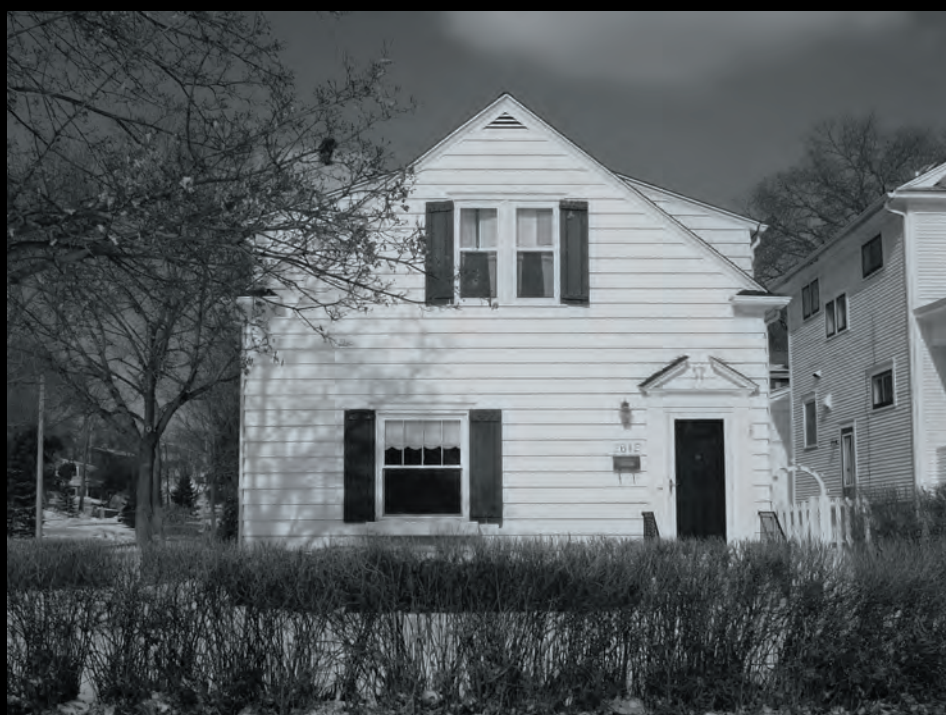
Front of Original House