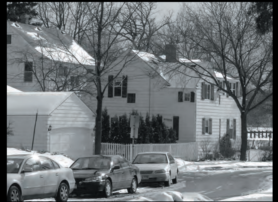
Back of original House