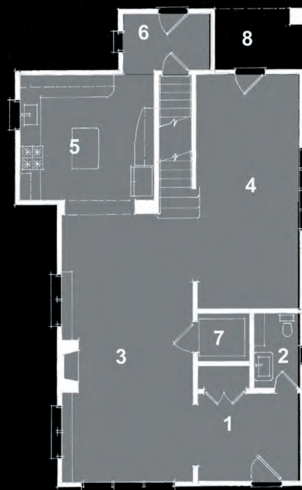
Main Floor Plan 1. Foyer 2. Powder Room 3. Living Room 4. Dining Room 5. Kitchen 6. Mudroom 7. Elevator 8. Back Porch