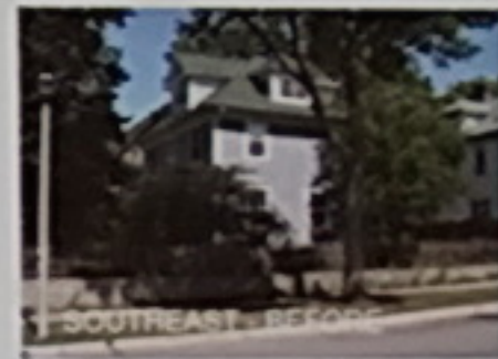
SOUTHEAST - BEFORE