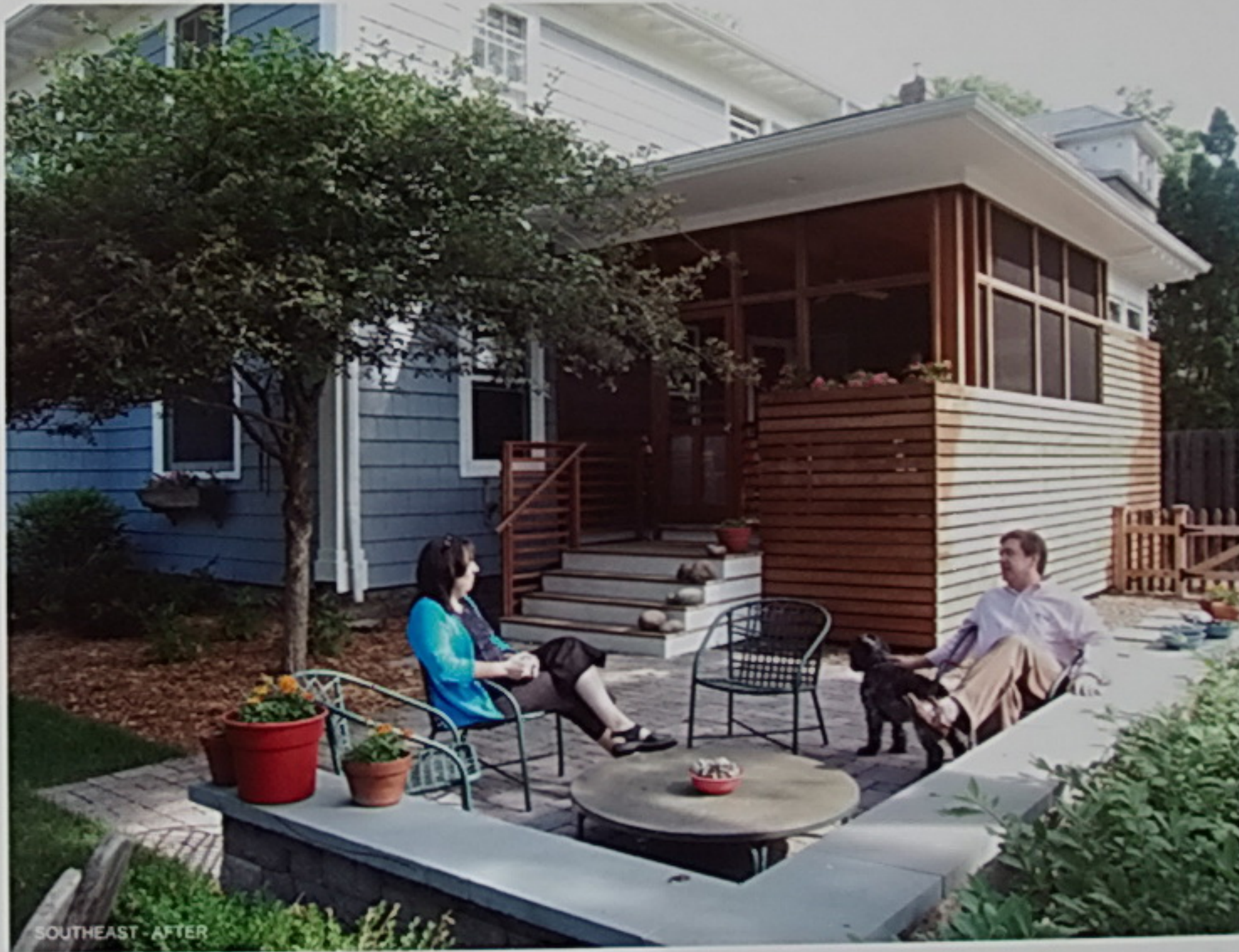
SOUTHEAST - AFTER