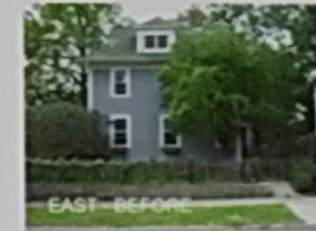
EAST - BEFORE