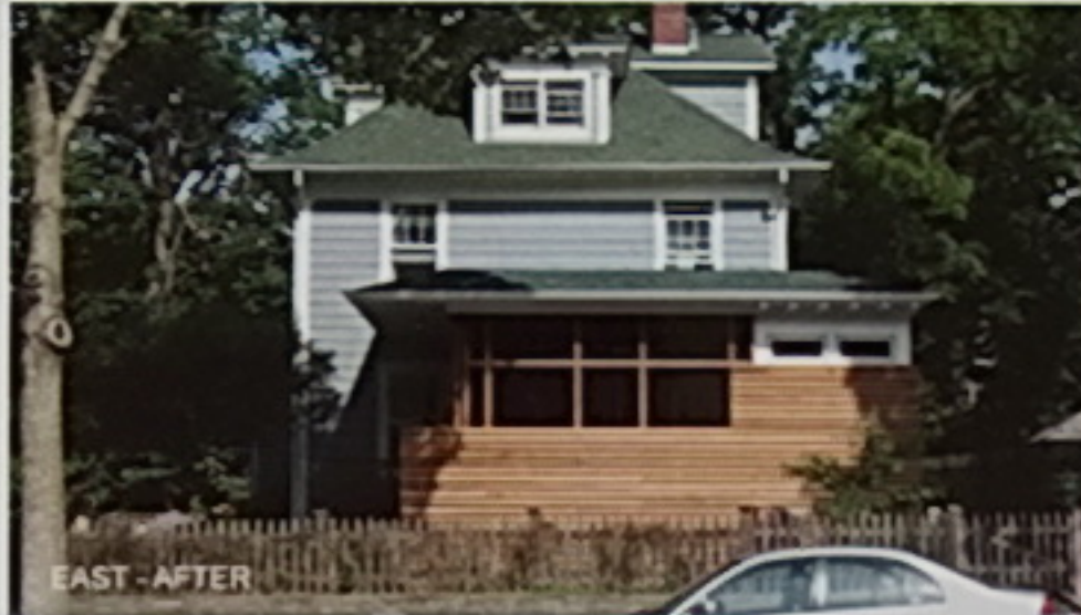
EAST - AFTER